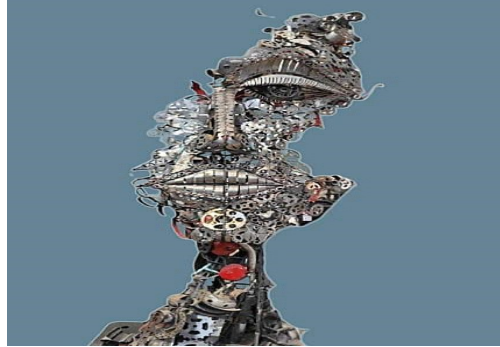
Figure 5: Human Face', 3.5ms X 1.5ms X 1m, Scrap Metal, 2024