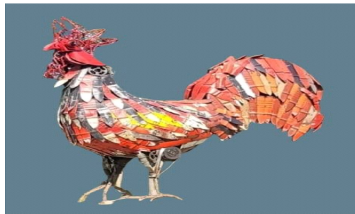
Figure 2: 'Rooster', 3ms X 1m X 2ms, Scrap Metal, 2024